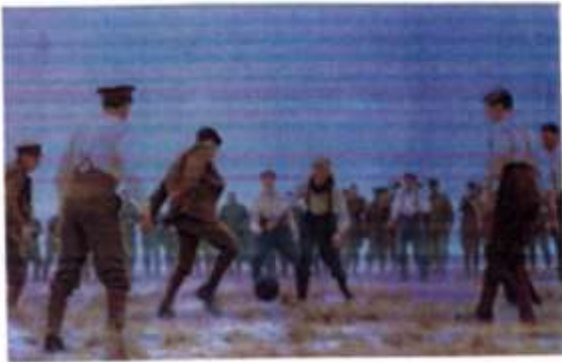
This is them playing football.

Interesting things are being reserved in letters from the front line. Amazingly British and German soldiers dropped their weapons and joined together to celebrate Christmas on Christmas eve an astonishing event occurred firstly German soldiers