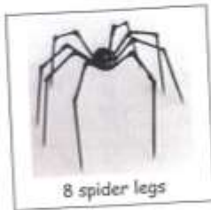
8 spider legs