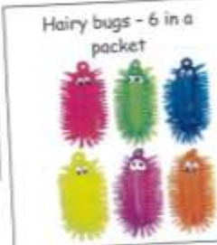
Hairy bugs - 6 in a packet