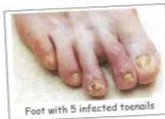
Foot with 5 infected toenails

How did you solve these multiplication problems?