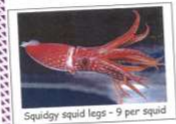
Squidgy squid legs - 9 per squid