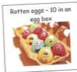
Rotten eggs - 10 in an egg box