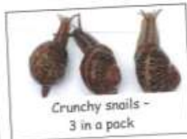
Crunchy snails - 3 in a pack