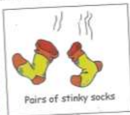
Pairs of stinky socks

Pick a number card to help him to work out how much of each ingredient he will need.