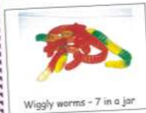
Wiggly worms - 7 in a jar